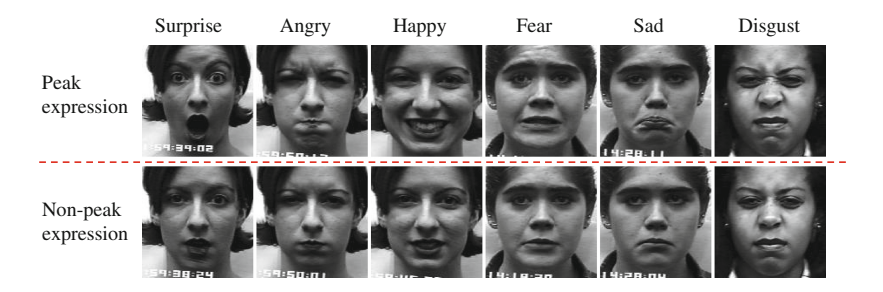
Fig. 1. Examples of six facial expression samples, including surprise, angry, happy, fear, sad and disgust. For each subject, the peak and non-peak expressions are shown.